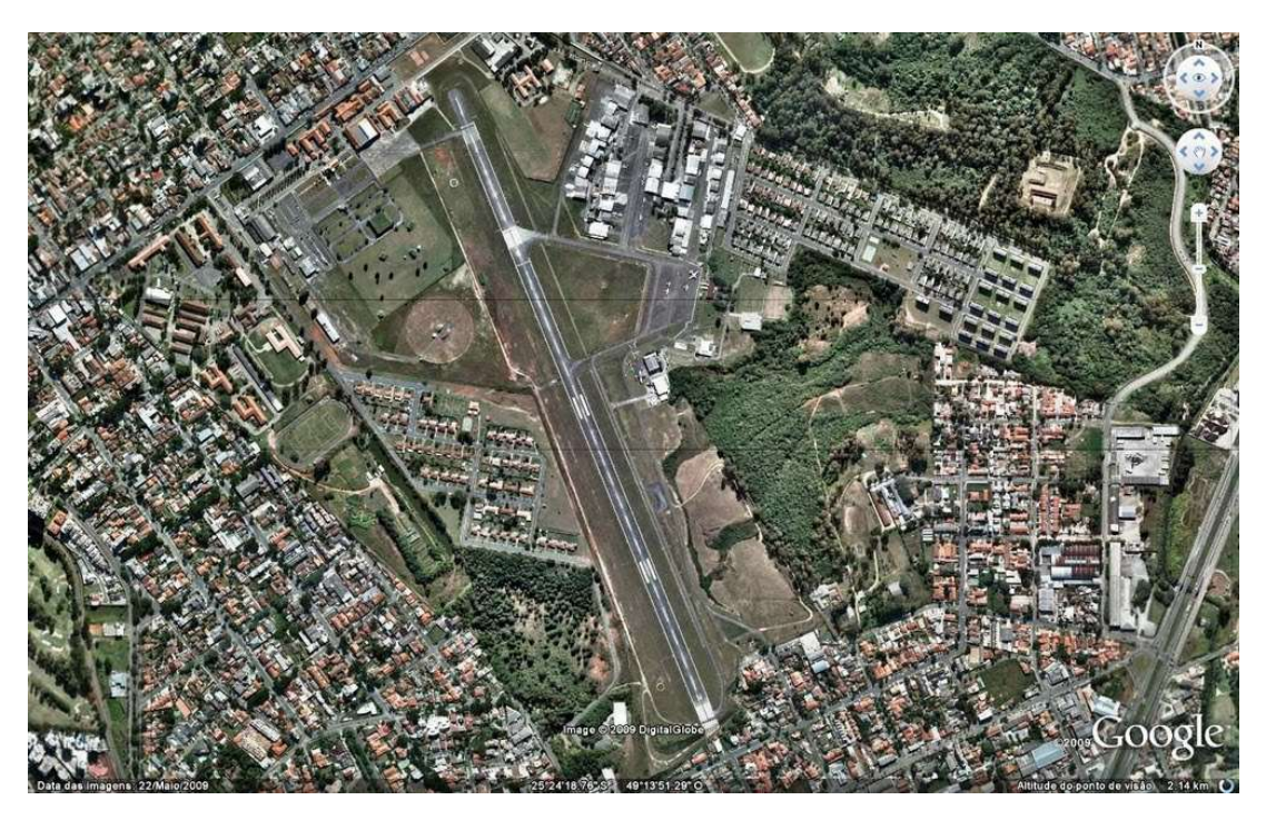
Figure 2. Aerial view of Bacacheri Airport and its surroundings

Figure 2 shows an aerial view of Bacacheri Airport, highlighting its runway and densely populated surroundings. Figure 3 shows a noise map calculated at the moment of takeoff of an airplane during the daytime, clearly indicating the high sound levels throughout the length of the runway, especially in its central portion, where the maximum equivalent sound pressure levels, L_{Max} , exceed 100 dB(A). The sound measurements for the creation of the noise map and subsequent calibration of the model with the calculated levels were taken at points located inside the airport. Also, note the environmental impact of the very high noise levels caused by aircraft takeoffs on the areas surrounding the airport. It should be kept in mind that takeoffs and landings occur frequently throughout the day, but as can be seen in Fig. 1, air traffic is especially intense in the morning.